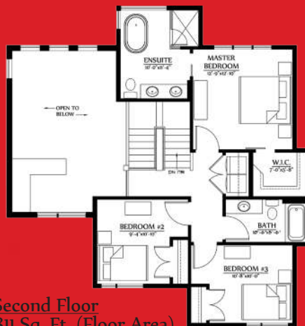
Second Floor 811 Sq. Ft. (Floor Area) 70 Sq. Ft. (Stair Area)