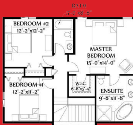
Main Floor 1077 Sq. Ft.